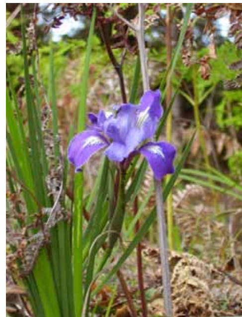
Douglas Iris near Pond Farm