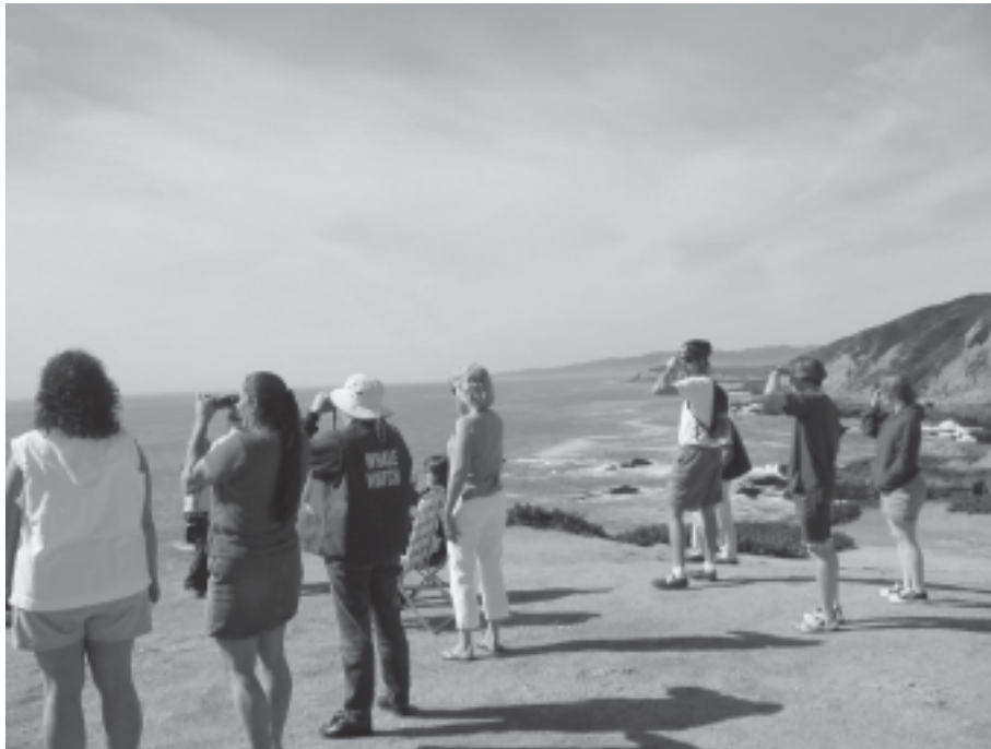
Whale Watches at Bodega Head assisting the public in viewing the annual migration.